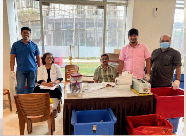
Rotary Club of Mumbai Greens collaborates with Tata Memorial Hospital