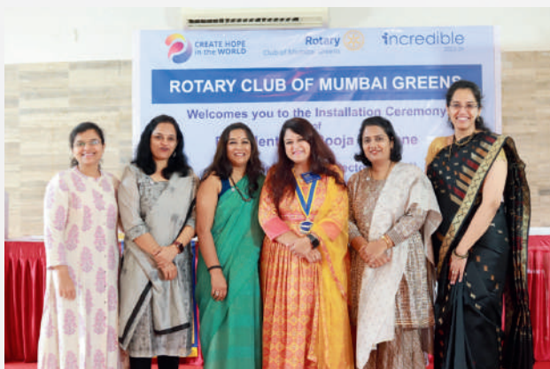
Club Women Power