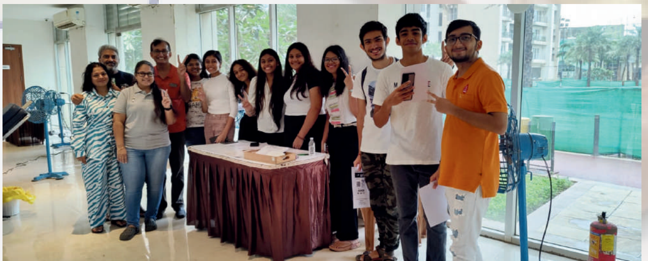
The enthusiastic team of Prospective Rotarians