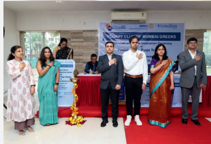
New Members for the year 2023-24 taking oath