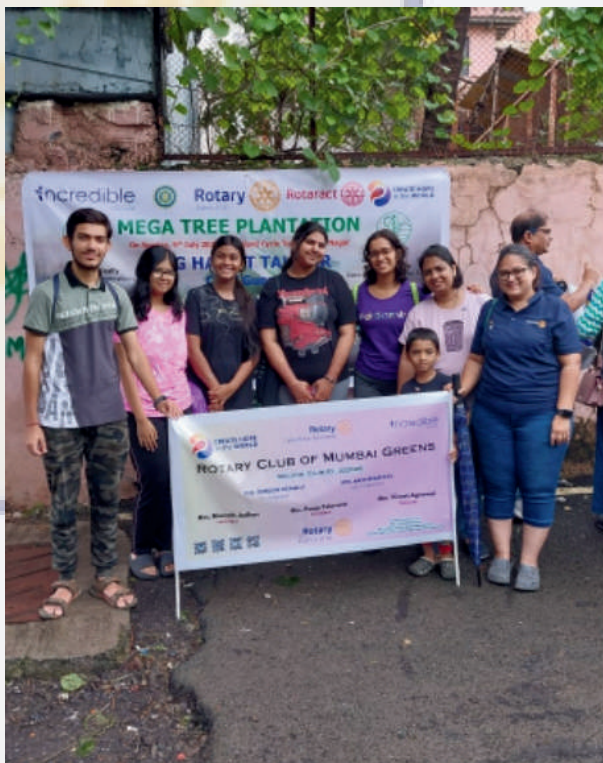
Prospective Rotaractors enthusiastically participated in the tree plantation drive.

The Rotary Club of Mumbai Greens commenced the new year by co hosting a significant Mega Tree Plantation drive., Setting a definitive tone for the upcoming year filled with hope and heightened awareness of our environment.