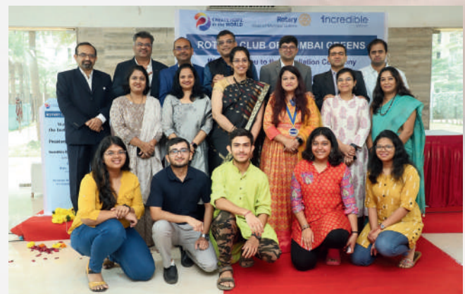
With Prospective Rotarators