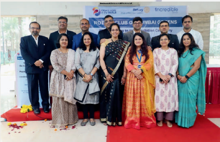
The esteemed President for 2023-24 of the Rotary Club of Mumbai Greens, with the Board of Directors for 2023-24